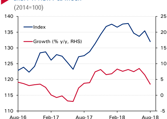
► Chart 1: NBK PCE index